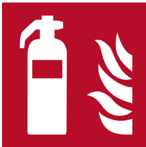
Example of location pictogram for a fire extinguisher

The location of extinguishers should be clearly visible and clearly indicated.